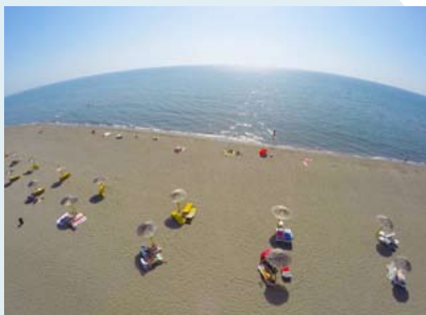
The resort beach - look from the air

And there is another restaurant in the middle of the naturist beach where you can be naked all the time.