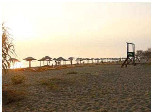
Picture 7. The resort beach