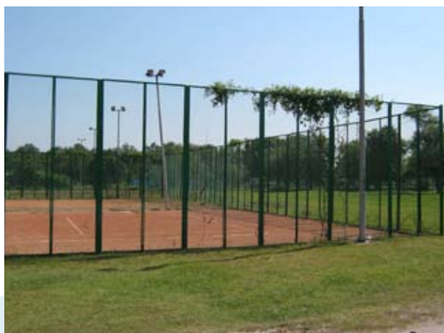
Tennis field in the resort