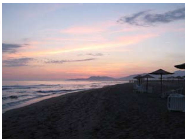
The legend says that there is the most beautiful sunset on the World

Naturist beach of the resort is now 2 km long and it is clean, with showers and beach chairs. You can be naked in all the area of resort except in the main building where is the reception and the restaurant are and in the area marked with a clear sign.