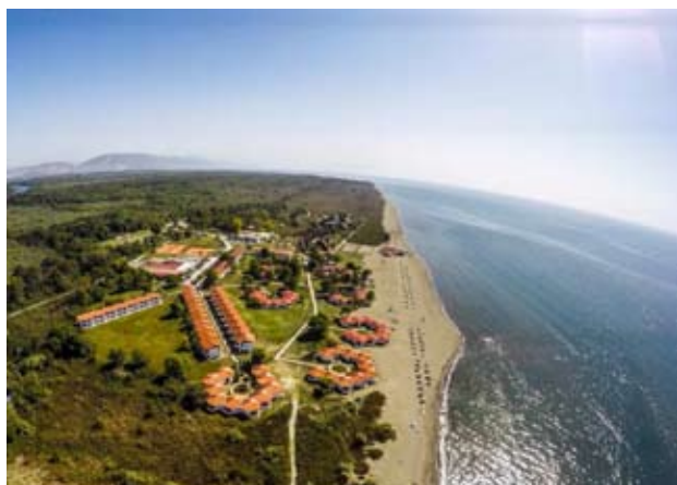
Island Ada Bojana today and location of the resort

The island is created by a river delta of the Bojana River. It was formed by gathering river sand around a ship sunk at the mouth of Bojana River.