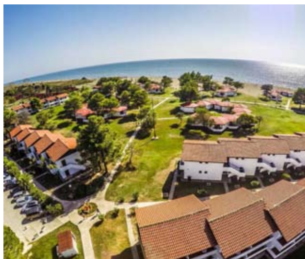
Picture 2. Close look to the resort from the air

First naturists came here in 1972 accommodated in 83 four apartments' houses with excellent view to the sea. All this area in those times was a part of Yugoslavia, power state with a great international image, which bring a brought golden times for this resort - during 70's and 80's each summer was a temporally home for more than 30.000 naturist from all over the World.