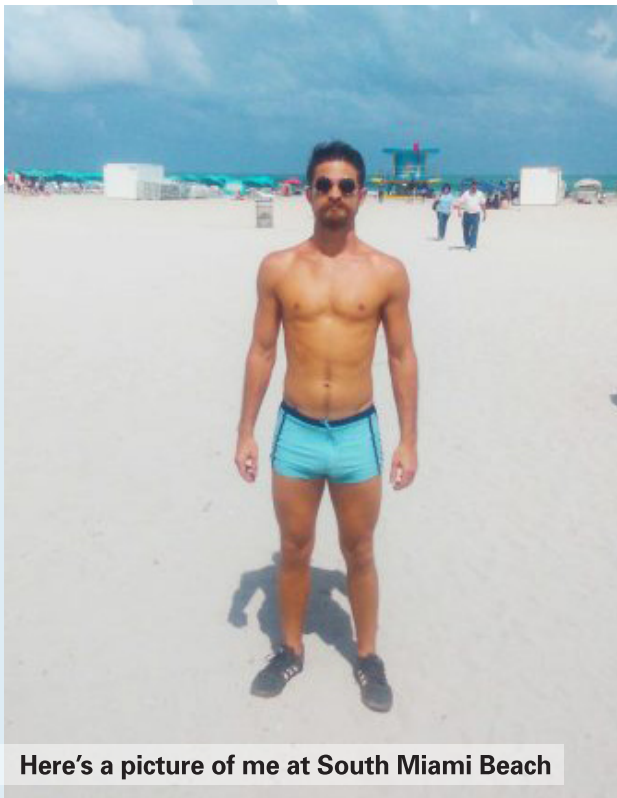
Here's a picture of me at South Miami Beach

By the way, don't think that I covered up once I left the beach area. Oh no. I walked all around town like that.